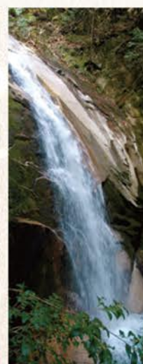
The Hakuryu Fall