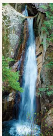
The Ryutou Fall