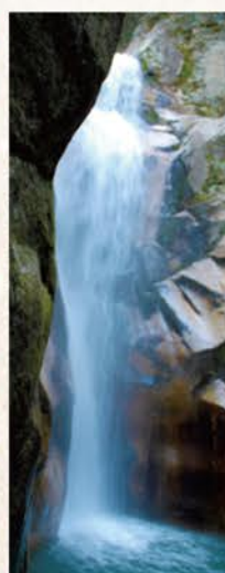
The Ryumon Fall