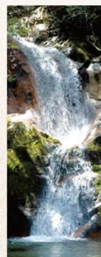
The Ryubi Fall