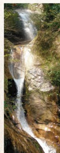
The Touryu Fall